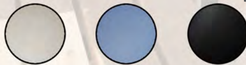
Pearl Blue Black