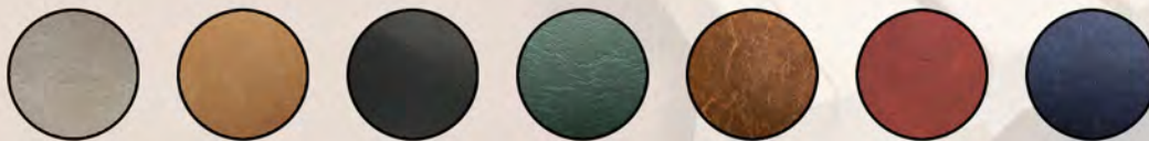
Almond Camel Charcoal* Forest Green Mocha Port Sapphire