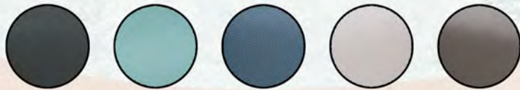
Graphite Caribbean Green Metallic Blue Off White Taupe