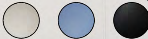
Pearl Blue Black