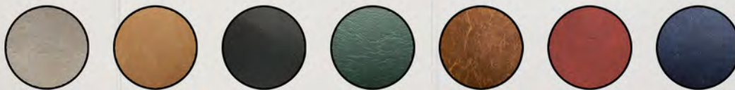
Almond Camel Charcoal* Forest Green Mocha Port Sapphire