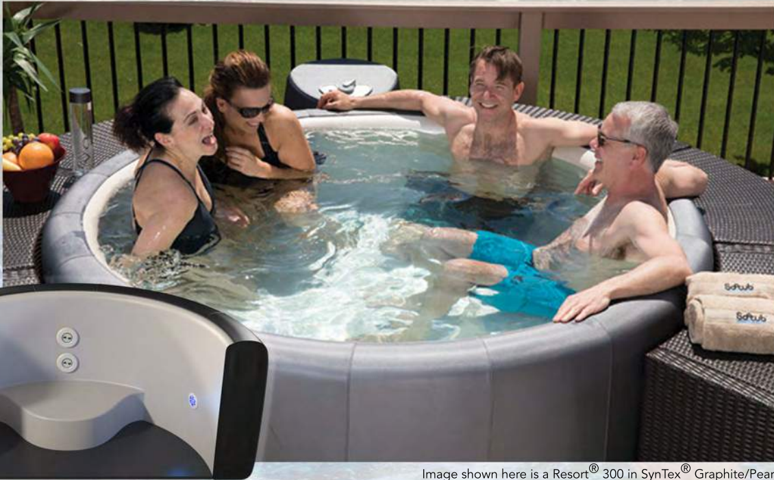
Image shown here is a Resort® 300 in SynTex® Graphite/Pearl with a San Diego PolyRattan Surround

Providing true comfort with the ability to entertain, the spacious Resort® 300 can accommodate up to 6 adults. At 6½ feet in diameter, this is truly a spa the whole family can enjoy. Custom built with an additional 3 inches in depth, the Resort® 300 allows our users to soak deeper for additional comfort, while coming standard with a therapy seat that is designed to elevate your soaking position, while strategically placed, pulsating jets sooth your upper and lower back.